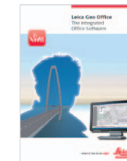
Leica Viva LGO Product brochure