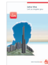
Leica Viva Overview brochure

Illustrations, descriptions and technical data are not binding. All rights reserved. Printed in Switzerland – Copyright Leica Geosystems AG, Heerbrugg, Switzerland, 2010. 781653en-us – VI.13 – galledia