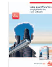
Leica SmartWorx Viva Product brochure