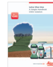
Leica Viva Uno Product brochure