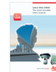
Leica Viva GNSS Product brochure