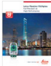
Leica FlexLine TS09plus Product brochure

Illustrations, descriptions and technical data are not binding. All rights reserved. Printed in Switzerland – Copyright Leica Geosystems AG, Heerbrugg, Switzerland, 2012. 781680en-us – V1.13 – galledia