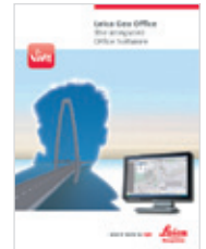
Leica Viva LGO Product brochure