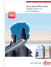
Leica SmartWorx Viva Product brochure