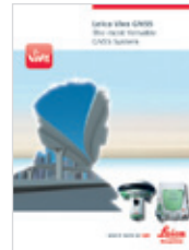
Leica Viva GNSS Product brochure