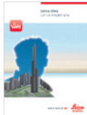
Leica Viva Overview brochure