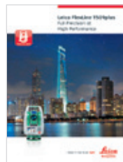
Leica FlexLine TS09plus Product brochure

Illustrations, descriptions and technical data are not binding. All rights reserved. Printed in Switzerland – Copyright Leica Geosystems AG, Heerbrugg, Switzerland, 2012. 781679en – VI.13 – galledia