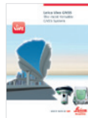
Leica Viva GNSS Product brochure