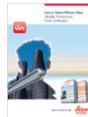
Leica SmartWorx Viva Product brochure