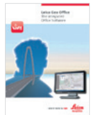
Leica Viva LGO Product brochure