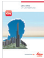
Leica Viva Overview brochure